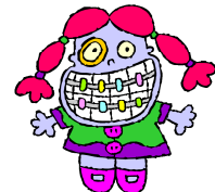
(a girl with braces)

I'm a little boy with glasses The one they call a geek A little girl who never smiles 'cause I have braces on my teeth And I know how it feels to cry myself to sleep I'm that kid on every playground Who's always chosen last A single, teenage mother Tryin' to overcome my past You don't have to be my friend But is it too much to ask