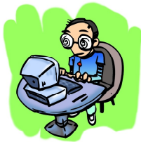
(a computer geek)

What don't you understand? Ask you friends and your teacher.